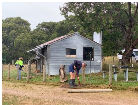
Image A LROC Gippsland Volunteering

If you have any hours to send in, please send them to projects@fwdvictoria.org.au . If you need a copy of the volunteer hours data sheet, they can be downloaded from the website, www.fwdvictoria.org.au . It is essential that any volunteer work no matter how small is recorded and sent in to be able to be include in the reports.