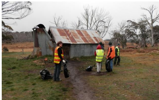
Image 2 LROCG Volunteer Work.

With many seasonal closure gates opening on the 27 th of October there are many clubs getting out there to assist land managers in track clearing. Please make sure to submit these volunteer hours to projects@fwdvictoria.org.au and thank you to all our clubs that complete countless volunteer hours. It is extremely important to Four Wheel Drive Victoria to be able to actually represent the hard work our amazing volunteers do on a regular basis