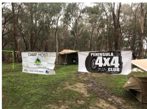
Image 3 Previous Peninsula 4x4 Camp Host