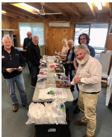
Image 1 The showbag packing crew

Four Wheel Drive Victoria will notify clubs of any extended closures as we are notified.