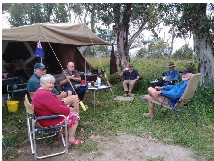
Photo 1 Macalister 4WD Club taking a well earned break during their camp host