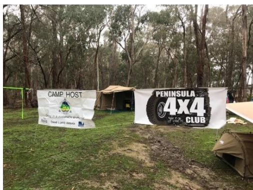
Image 2 Previous Peninsula 4x4 Camp Host

The new year is not far away which brings with it the next opportunity for a camp host. The Australia Day weekend provides an excellent opportunity for your club to host a camp host! Acting as a point of contact in a campground for Parks Victoria and DELWP, as well as a helpful guide for those new to the area, a camp host allows your club the great opportunity to showcase its community values in assisting others and even works a great promotional tool for your club in attracting new members.