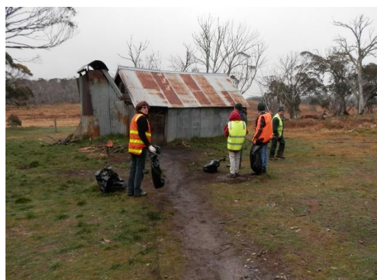
Image 1 LROC volunteers cleaning up Howitt Hut

It is extremely important to Four Wheel Drive Victoria to be able to actually represent the hard work our amazing volunteers do on a regular basis