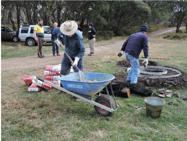
Image 1 Members from Land Rover Owners Club of Gippsland assisting Parks Victoria works.

Whilst we are all stuck at home during lockdown it is always a great chance to reminisce about past trips and plan out future trips to undertake. Lockdown also provides an excellent opportunity to make sure your safety and recovery gear is up to date and ready to go and replace any part of it that needs to be changed out.