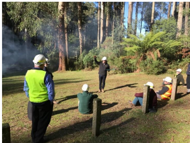
Photo: DELWP staff at the Central Highlands Field Day

At the Central Highlands field day, discussions were held around how we measure old growth forest, use Elliot Traps, and survey techniques that we are using in the Forest Protection Survey Program.